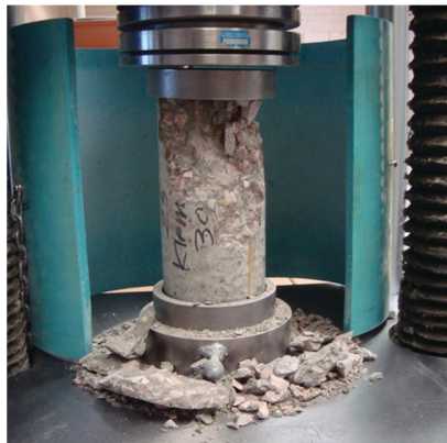
Fig. 3. Compressive strength test.

Compression tests were conducted on the specimens to measure their compressive strength, using the equipment shown in Figure 3. The testing procedures adhered to the guidelines specified in ASTM C39 standards [28].