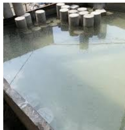
Fig. 2. Water curing.