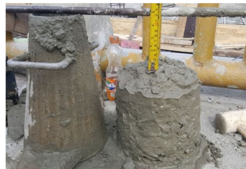
Fig. 1. Slump test.

Both fresh and hardened concrete were tested in this study. Figure 1 shows our compliance with ASTM C143 [27] standards by performing the slump test on the fresh concrete. At the same time, we assessed the compressive strength of 100 mm × 200 mm cylinders made of dense concrete, which were submerged in water for 3, 7, and 28 days after casting (Figure 2).